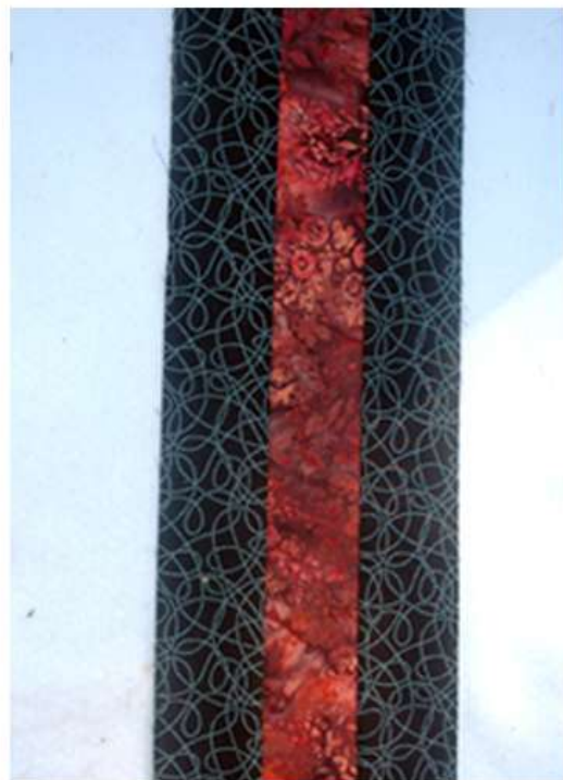
Strip Set B