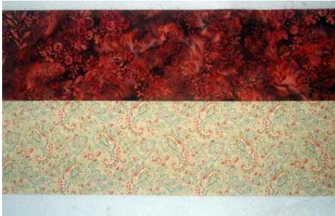
E Strip Set