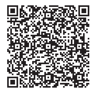
Find the poster hanger I used on Amazon by scanning the link above!